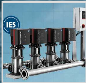
GRUNDFOS Pumps for Commercial Buildings