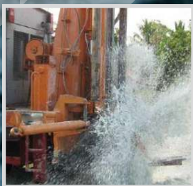
Tubewell Drilling and Rainwater Harvesting

KNOW ABOUT US & LEARN HOW WE WORK TOWARDS BUILDING A BETTER TOMORROW