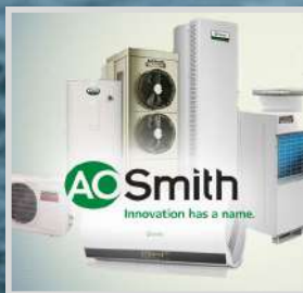
AO Smith Heat Pump Water Heaters