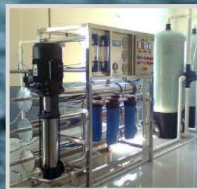
Water Treatment and components