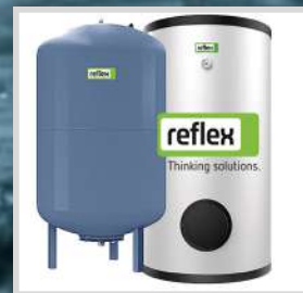
Expansion Tanks / Hot Water Storage Tanks